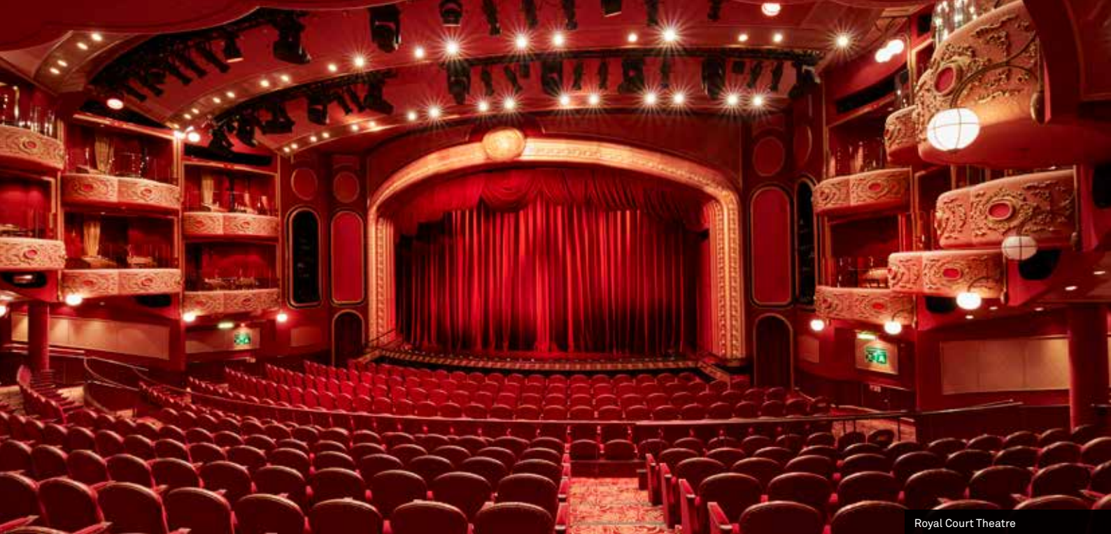
Royal Court Theatre